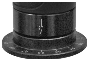
Adjustable Chamfer Depth