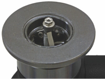
(3) Triple-Edged Cutting Heads